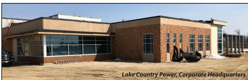
Lake Country Power, Corporate Headquarters

Consider Northland for your next project! Call for a quote today. (218) 722-8170 • www.northlandconstructors.com